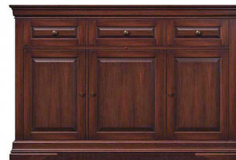
FRONT VIEW (shown with wooden panels on doors)